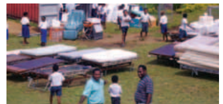
Unloading the container of medical supplies.