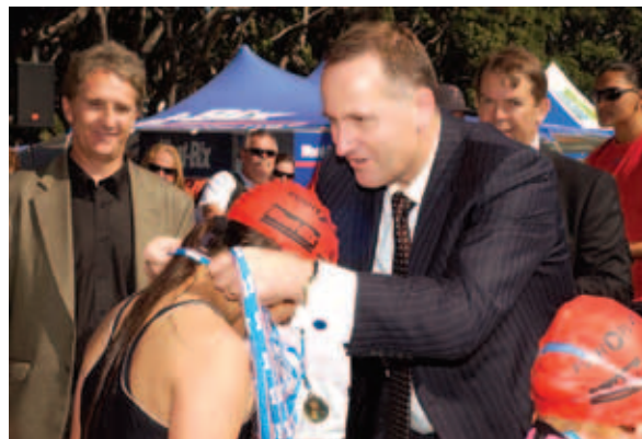
New Zealand prime minister John Key presents a medal to a Weet-Bix Tryathlon participant. All children who take part in the Tryathlon series receive a medal.