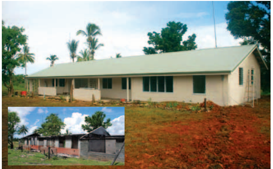
Kwailabesi clinic in Vanuatu, before (inset) and after (large photo) renovations conducted as part of the "Adopt-A-Clinic" program.